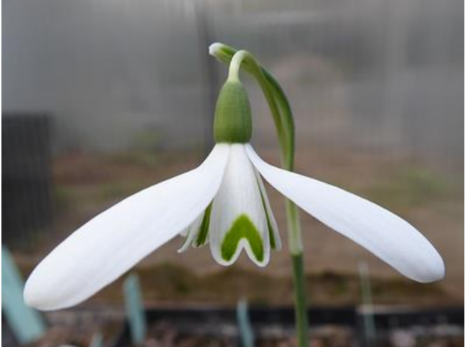
I saw many forms of Galanthus reginae-olgae flowering in the gardens that I visited in the south but all our attempts to establish it in the open garden here have failed, however we can grow it in pots under glass, plus I have some growing in the sand beds.