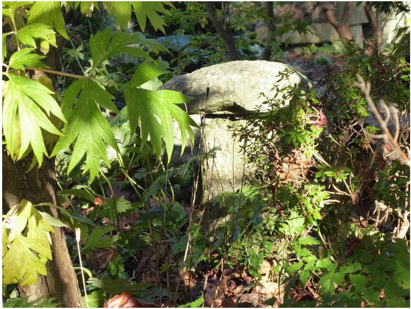
I have used the 'back light' bracketed mode of the camera, Panasonic Lumix DMC-TZ70, to better capture the colours in this high contrast scene....