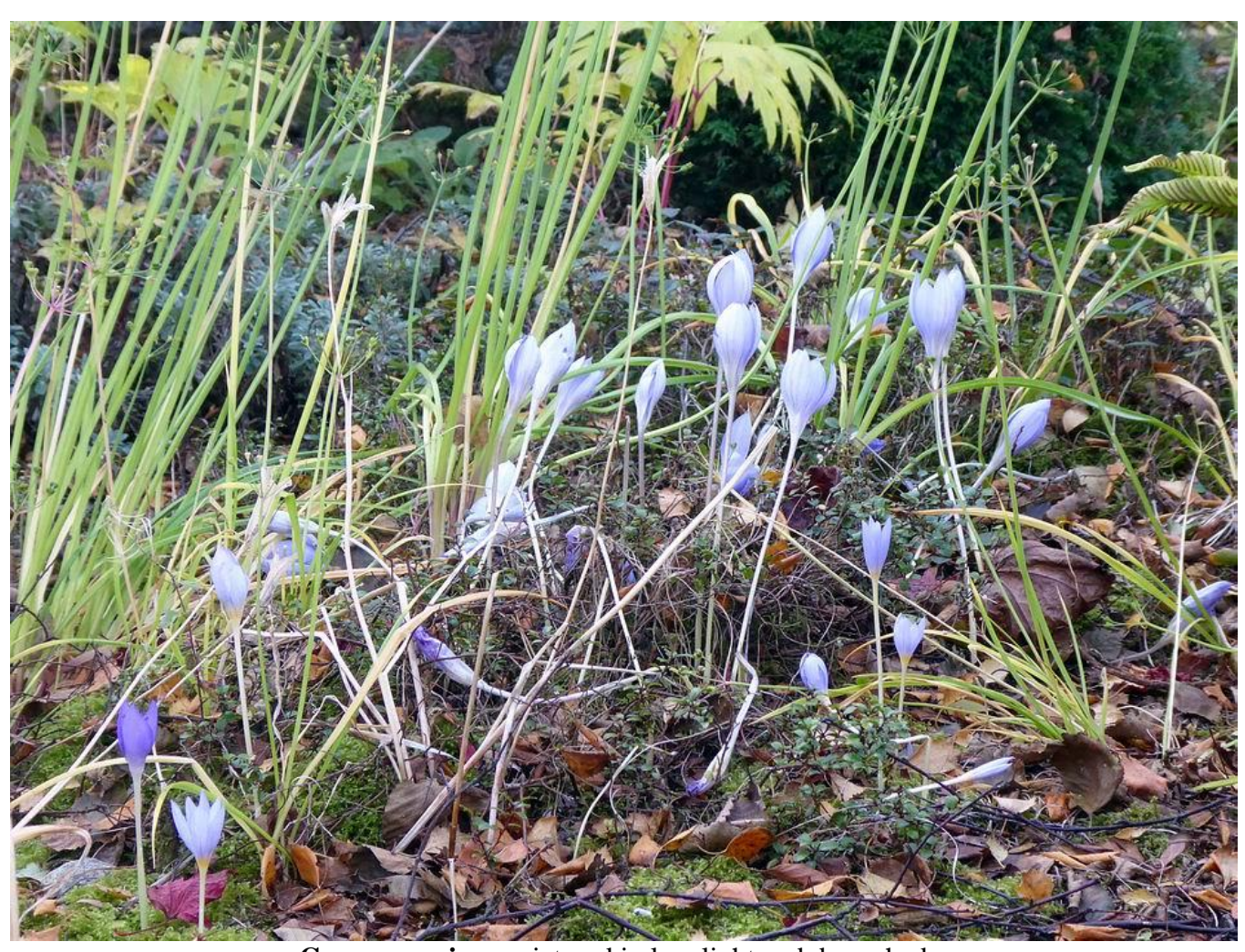
Crocus speciosus pictured in low light and deep shade.