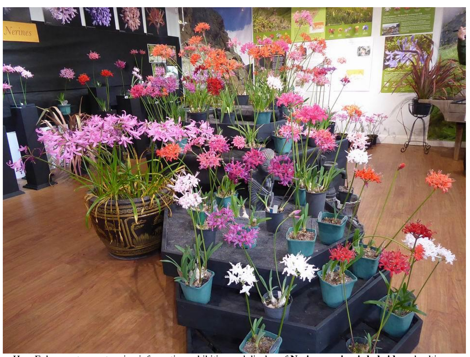
Here Exbury put on a stunning informative exhibition and display of Nerine sarniensis hybrids and cultivars.

I was about to be amazed and learn a lot more about this genus starting when I entered the Five Arrows gallery at Exbury Gardens.