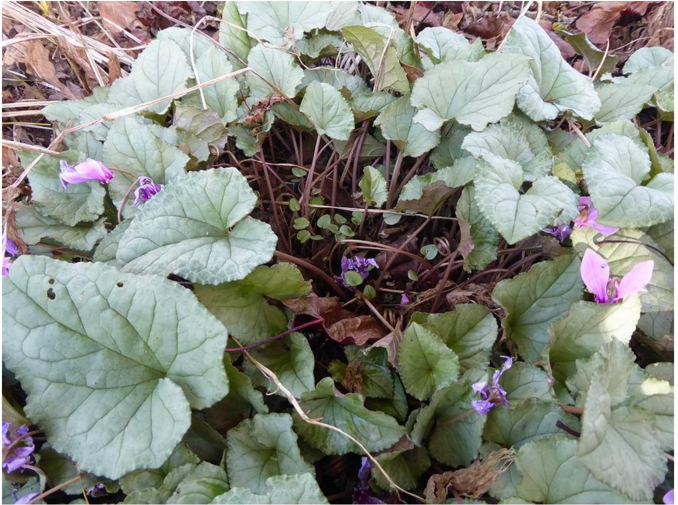
Once more with nothing except me to distribute the seeds in our garden these Cyclamen seedlings are growing on top of the mother corm. Soon I will do as I did last year when I lifted and potted some of the seedlings.