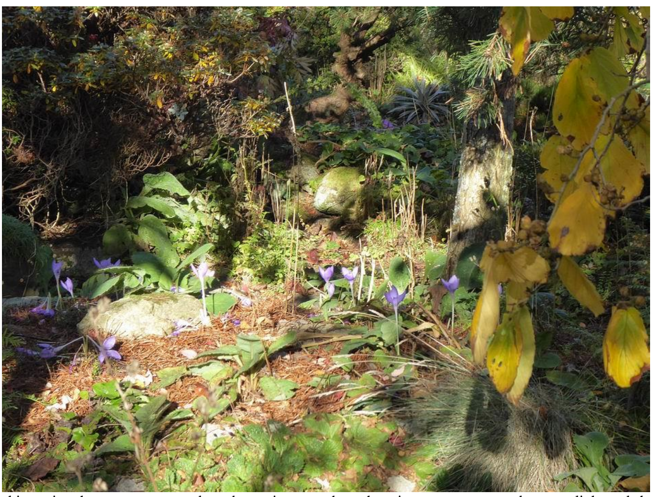
Using this setting the camera can produce decent images where there is a strong contrast between light and shade.