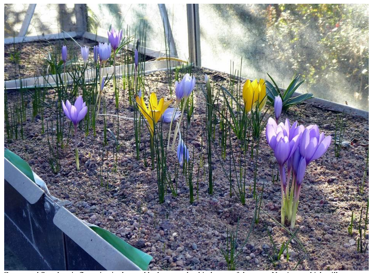
Crocus and Sternbergia flowering in the sand bed among the thin leaves of the many Narcissus which will soon take over as they come into flower and provide interest throughout the winter and into spring.

but now I am getting great pleasure from this method, learning as I go which plants are best suited to this habitat and how I need to adjust my watering and feeding regimes to maximise the flowering.