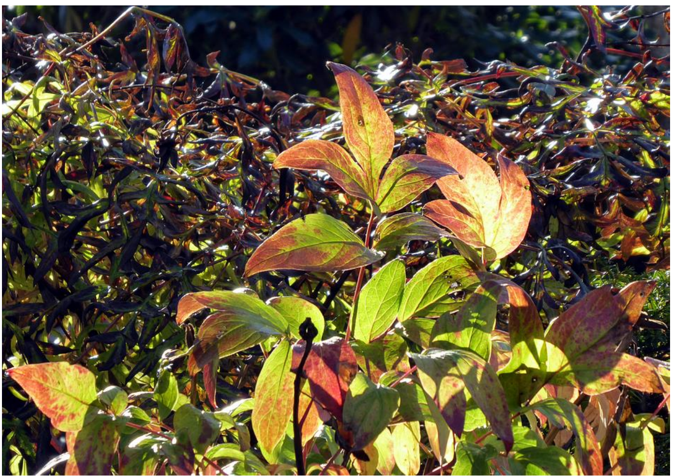
Every year I am attracted to the stained glass effect as the low sunlight illuminates the peony leaves from behind.