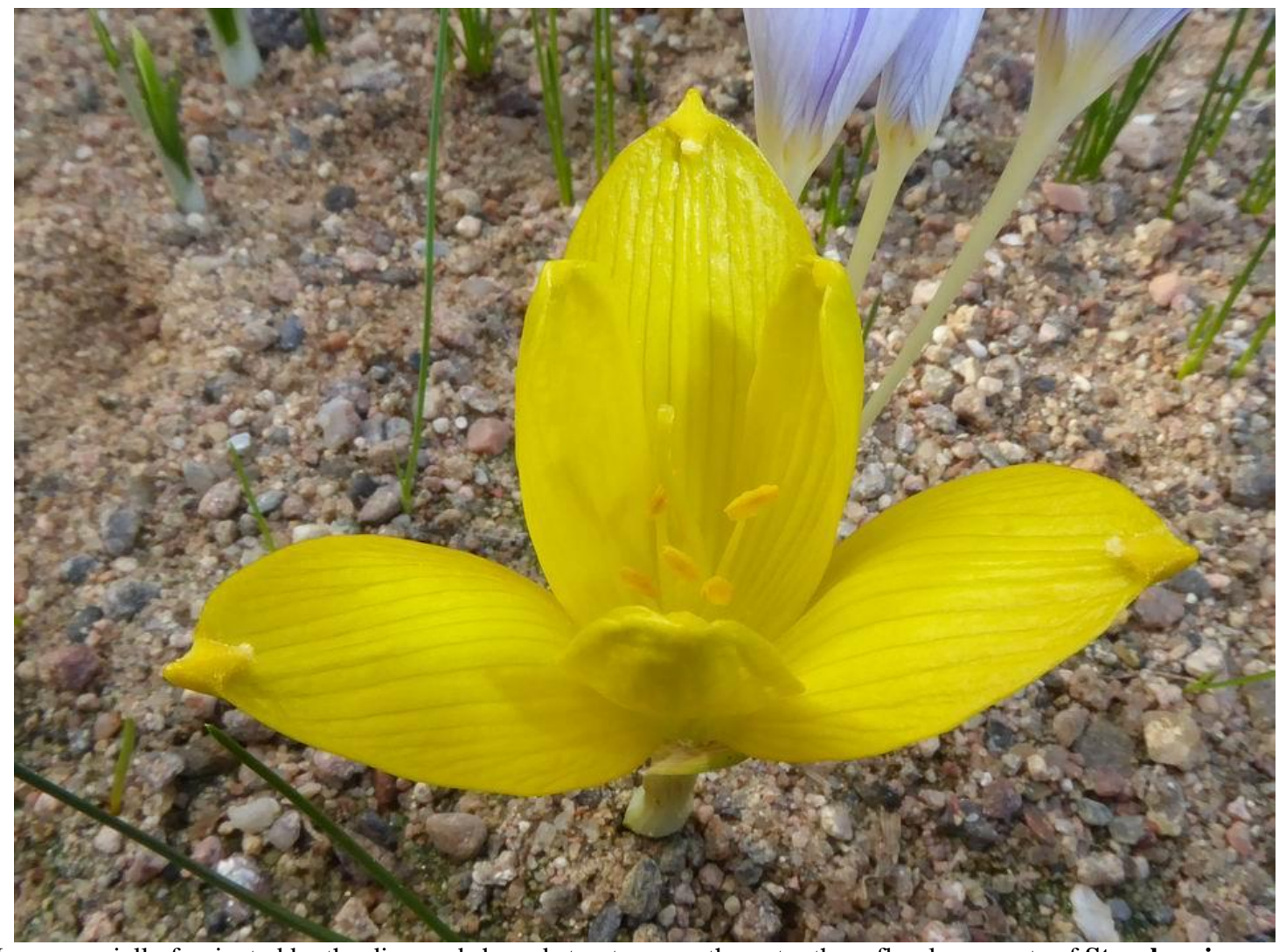
I am especially fascinated by the diamond shaped structures on the outer three floral segments of Sternbergia clusiana the lower tip of which has a uneven structure that I speculate may act as a wick or similar as an aid to attract pollinators.