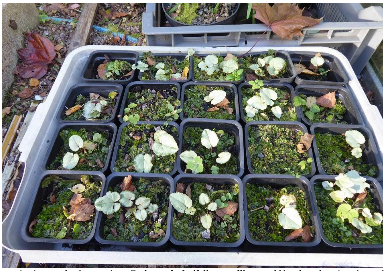
After growing in a pot for the year these Cyclamen hederifolium seedlings could be planted out into the garden.