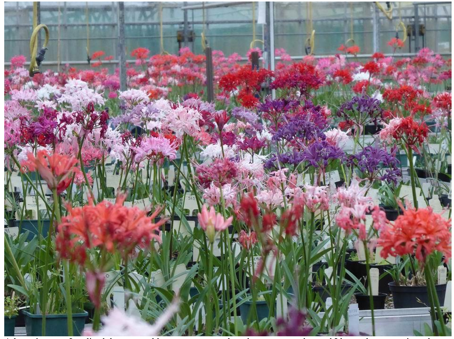
A long time ago I realised that we could not grow every plant that we wanted to and I learned to appreciate plants in other people's gardens; like here where I can see the attraction of growing and exploring the range of these colourful plants especially when you see them in these numbers and can appreciate the variation.