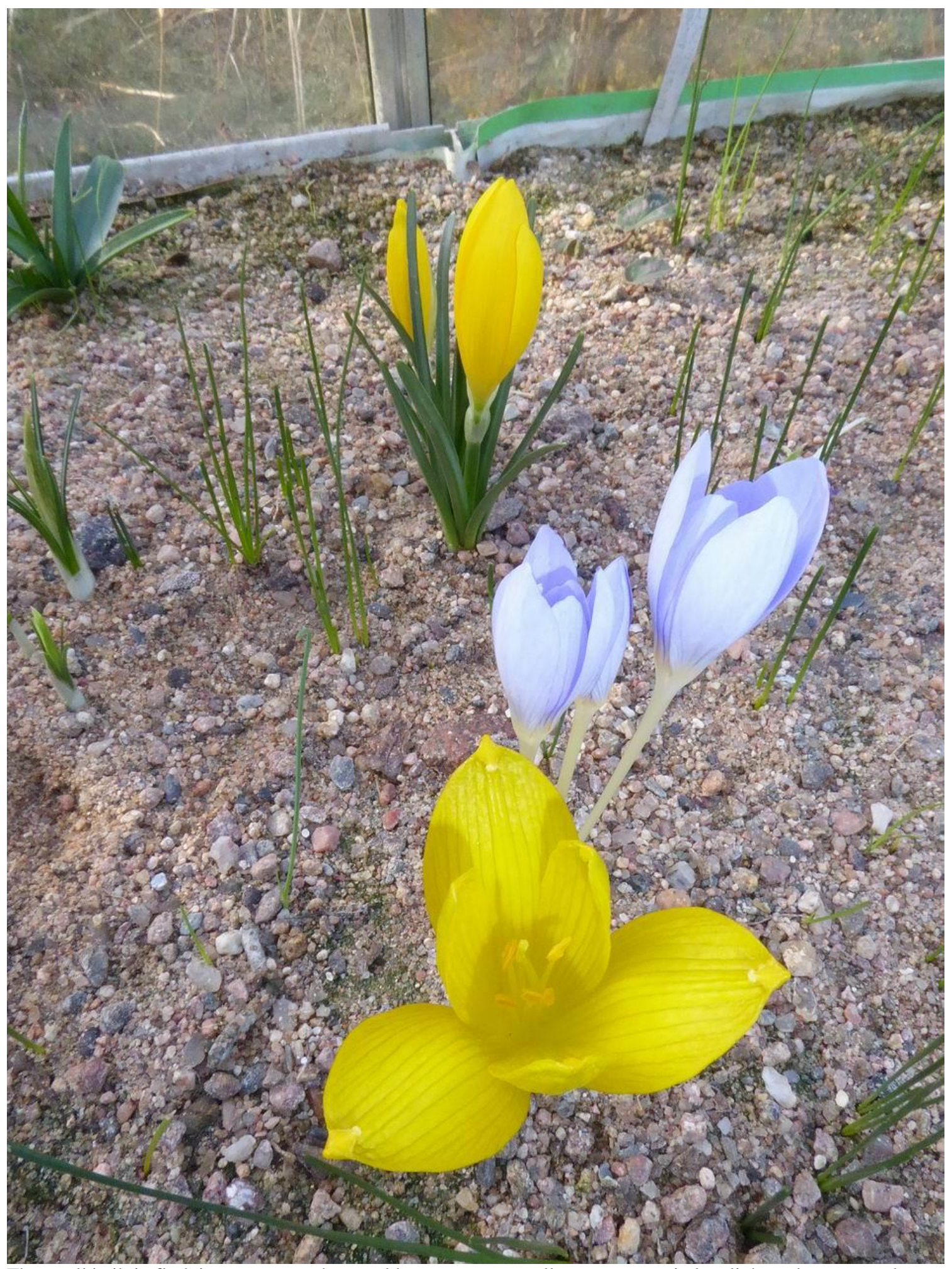
The small built in flash is strong enough to enable me to use a small aperture even in low light and so capture better details in these flowers of Sternbergia clusiana , Crocus pulchellus and Sternbergia lutea .