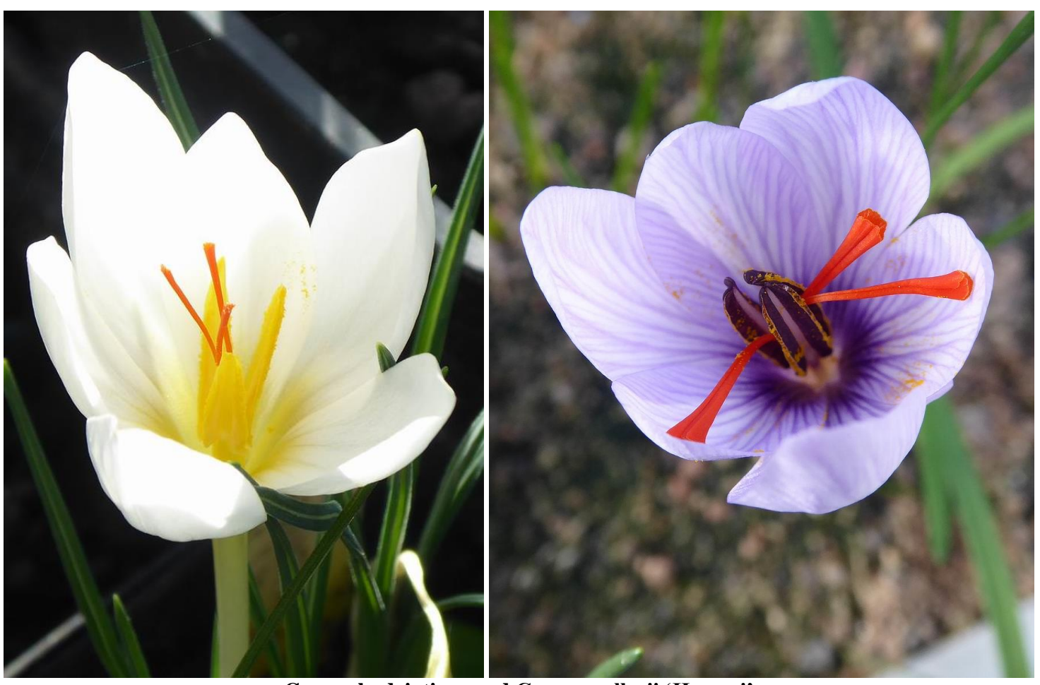
Crocus hadriaticus and Crocus pallasii 'Homeri'