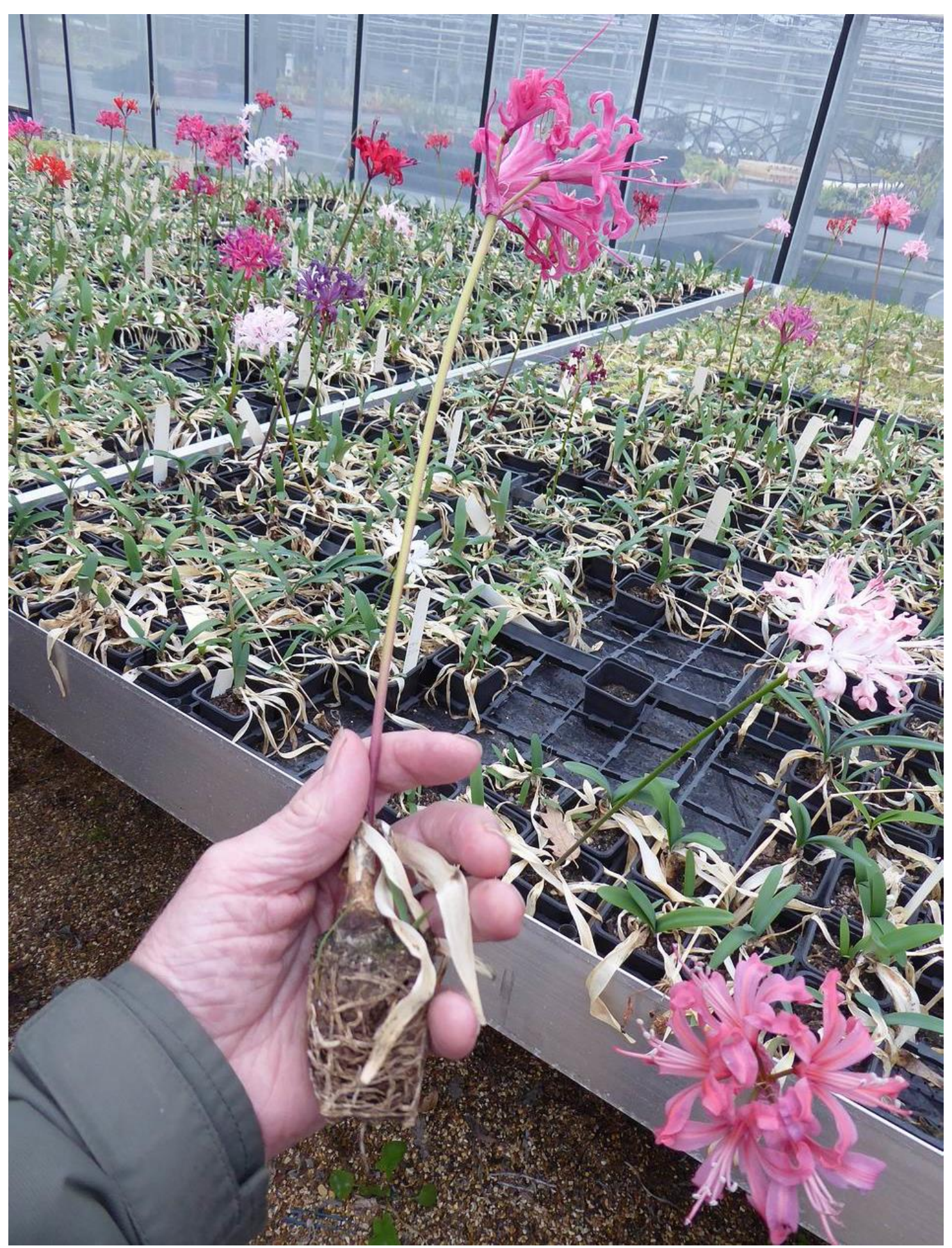
Theo showed me how he sows the seeds individually in cells filled with a John Innes compost where they grow, with regular liquid feeds, until they flower at which time they will be assessed to see if they are worthy of moving into the collection. I was amazed that such a big bulb could grow to flower in such a small volume of compost: if you want to read more about this wonderful collection including the store where there is a great range on offer click the link to visit the <a href="Exbury Nerine">Exbury Nerine</a> and <a href="Lachenalia Collection">Lachenalia Collection</a>