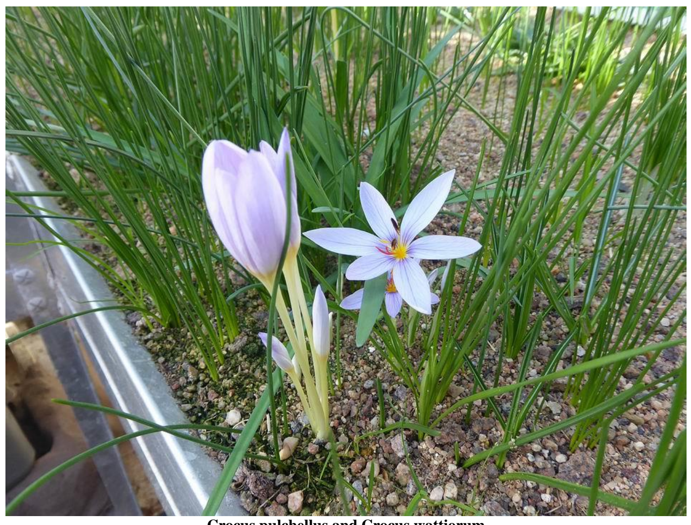
Crocus pulchellus and Crocus wattiorum The next series of images are of bulbs growing in the various sand beds.